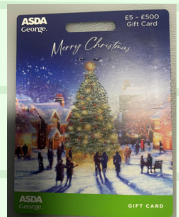
Gift vouchers from Forever Young People