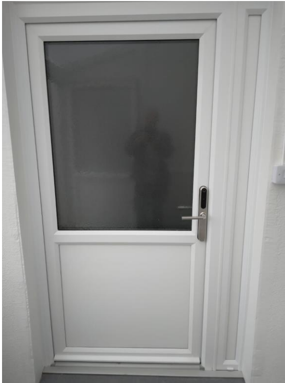
Installation of smart locks for the new Porch door and ground floor bedroom for easy access for carers