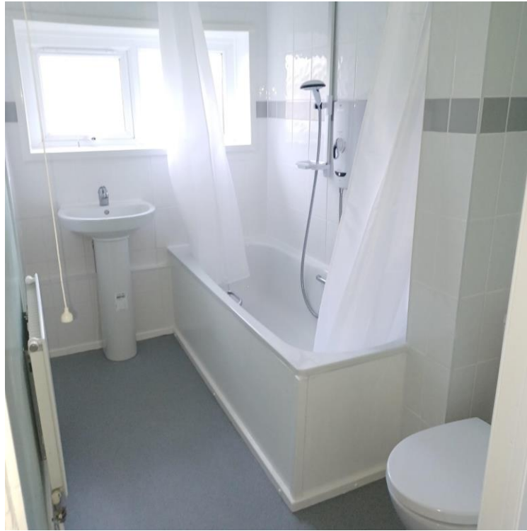
Decent Home Bathrooms