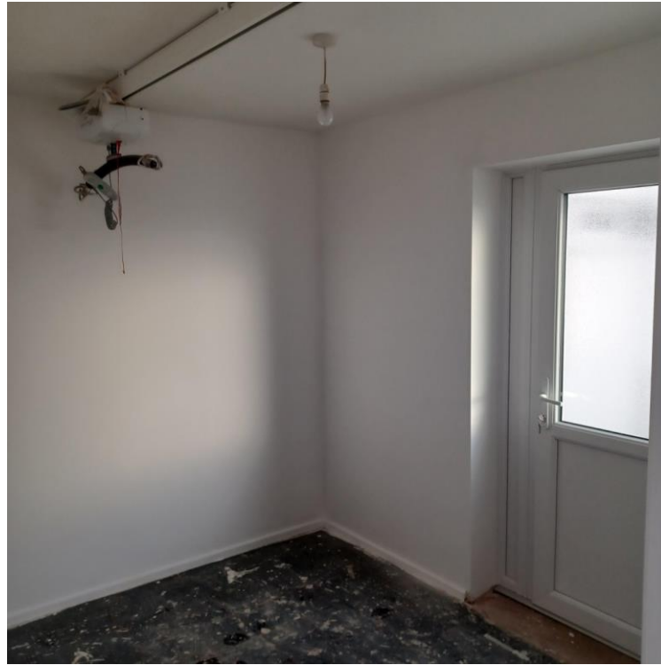
Ground floor bedroom window replaced with a wheelchair accessible UPVC door into new Porch Area