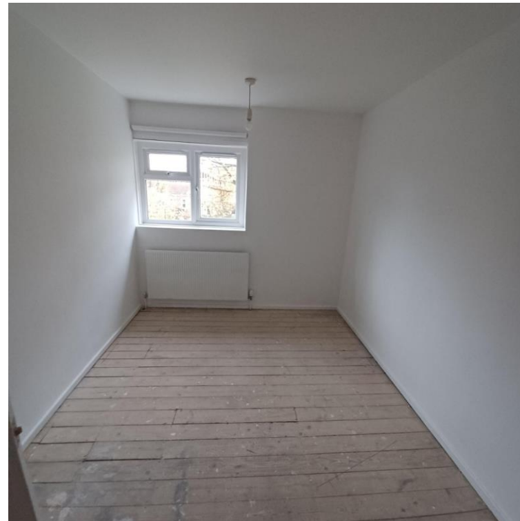
All wallpaper in each room including hallway, stairwell and landing were removed, prepared & whitewashed