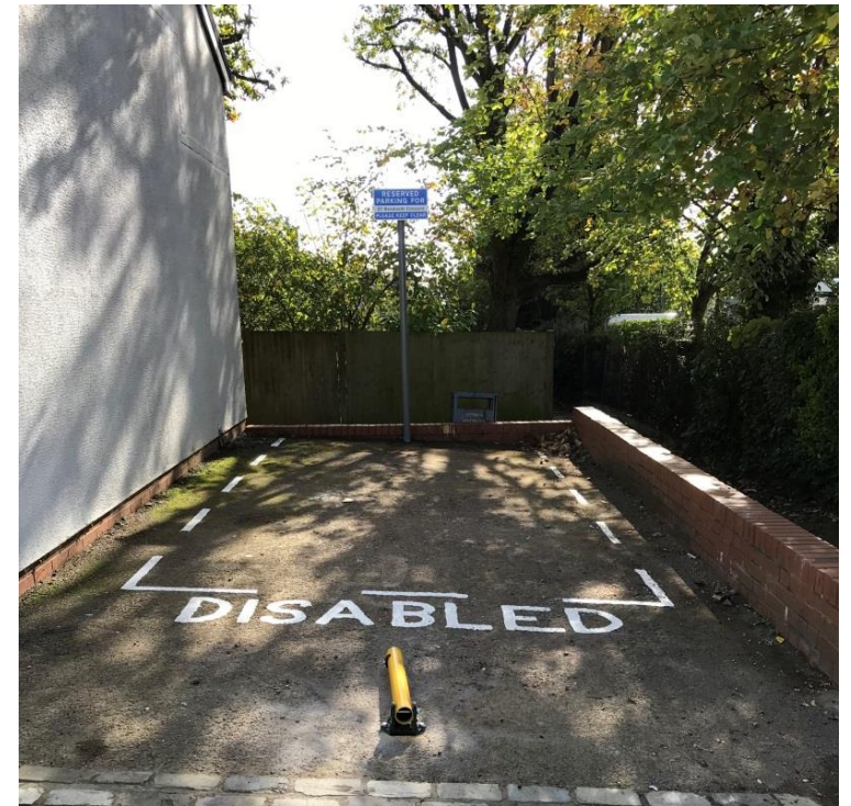
Signage at the rear of the property and allocated parking including drop down bollard