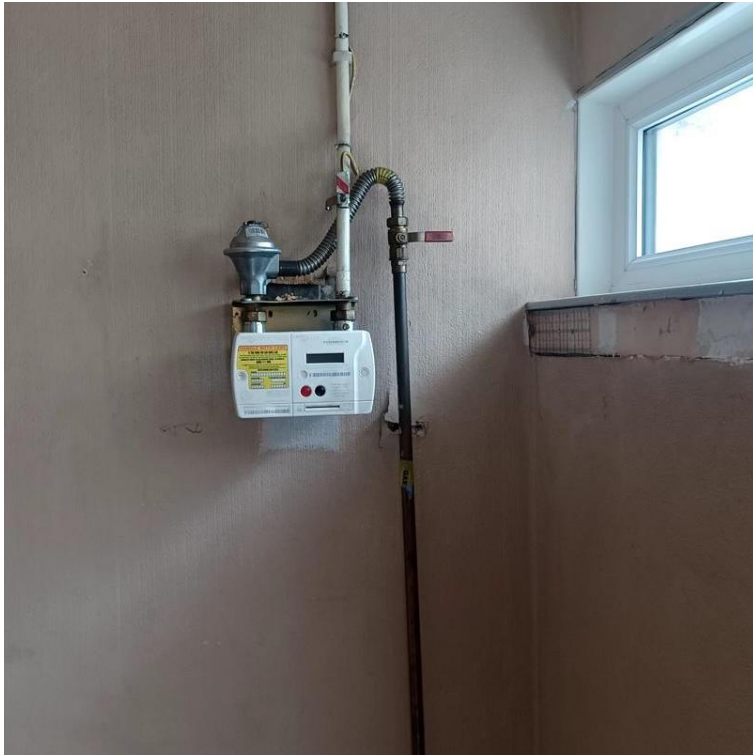
Gas Meter relocation

A range of adaptations and Decent Home Work were completed at the property by the Borough Council's Aids and Adaptations Team