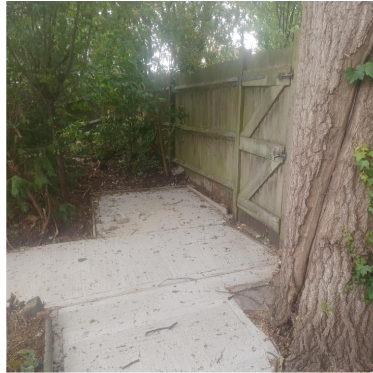
Bin store near back gate