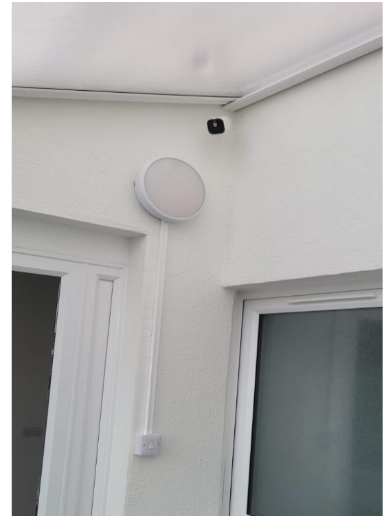
Installation of two cameras enabling the family to keep an eye on Tia and any carers coming into their home

Other works included new porch with wheelchair accessible 1m UPVC Doors at front of property, Asbestos Removal, Garden Clearance and Front Access Clearance and re-bedding existing paving.