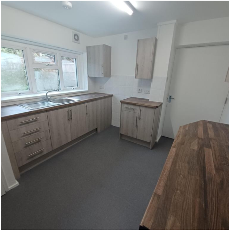
Decent Home Kitchen