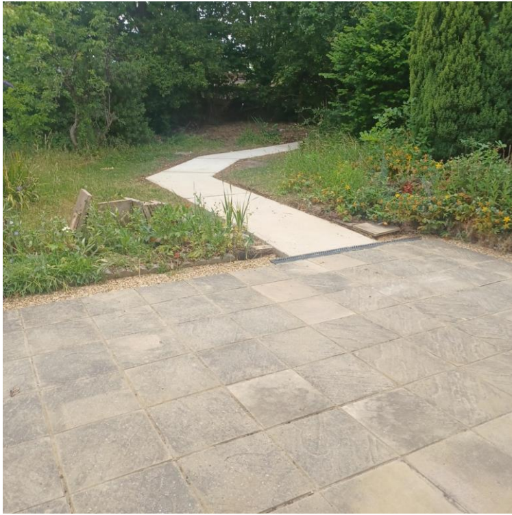
Raised up existing patio, reusing slabs to form wheelchair access from living room to patio area and the side of the property