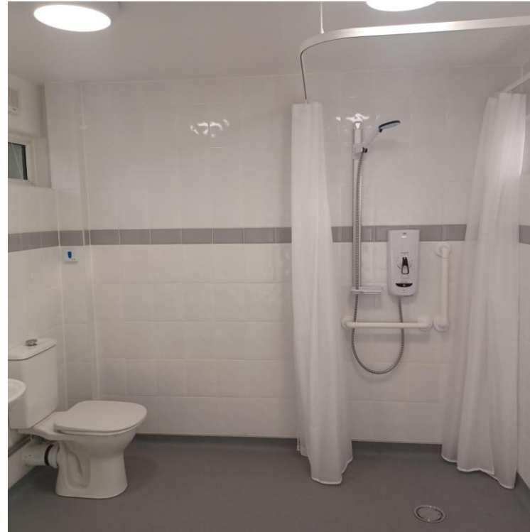
Converted the shed into a large wheelchair accessible Level Access Shower Room including access into new Porch and internally blocking off rear access door