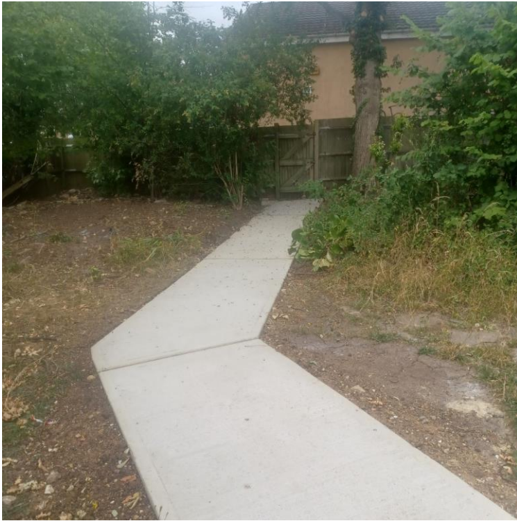
New 16 metre wheelchair accessible footpath to back gate