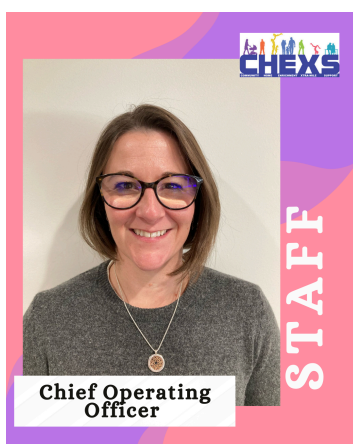
Chief Operating Officer